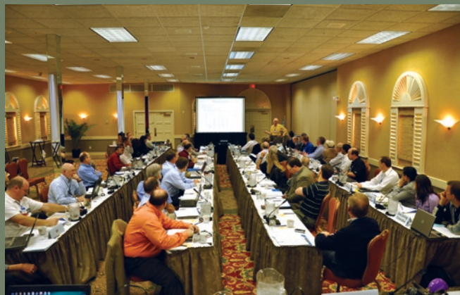
AmeriTAC 101 participants addressed 41 forum questions.