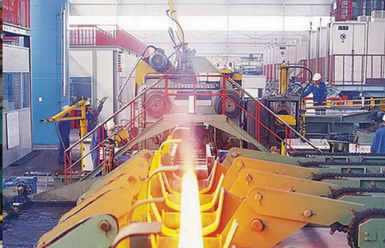
Hot Extrusion Press

other Chinese manufacturers to the benefits of membership in MTI.