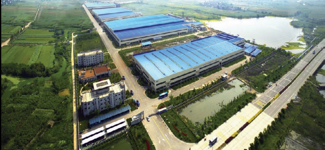
Jiuli Industry Park in China

Please contact us at 314-576-7712 or mtiadmin@mti-global.org for more information or to find out how your company can become a member.